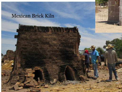
Mexican Brick Kiln