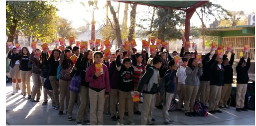
San Luis Students and their Dictionaries

with the construction of a block storage facility in the Block Yard. They were featured on the local news one evening. Thank you for your service above self in San Luis Rio Colorado.