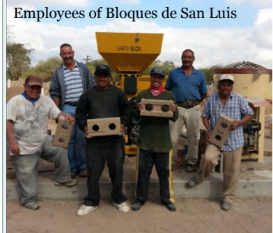
Employees of Bloques de San Luis