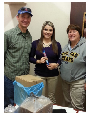
Dental Kits for Social Services