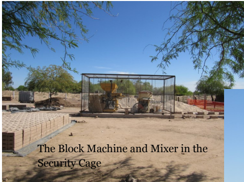
The Block Machine and Mixer in the Security Cage

We are so grateful to Rotary International, West Calaveras Rotary, Stockton Rotary, Angels/Murphys Rotary, Antioch Rotary, Rotary Club of the Delta, and San Luis Rio Colorado Rotary and our friends and donors for making this project a reality.