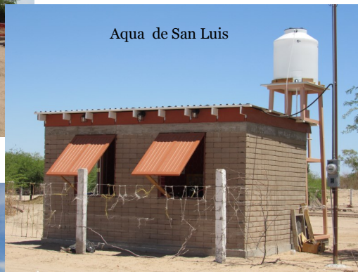
Aqua de San Luis